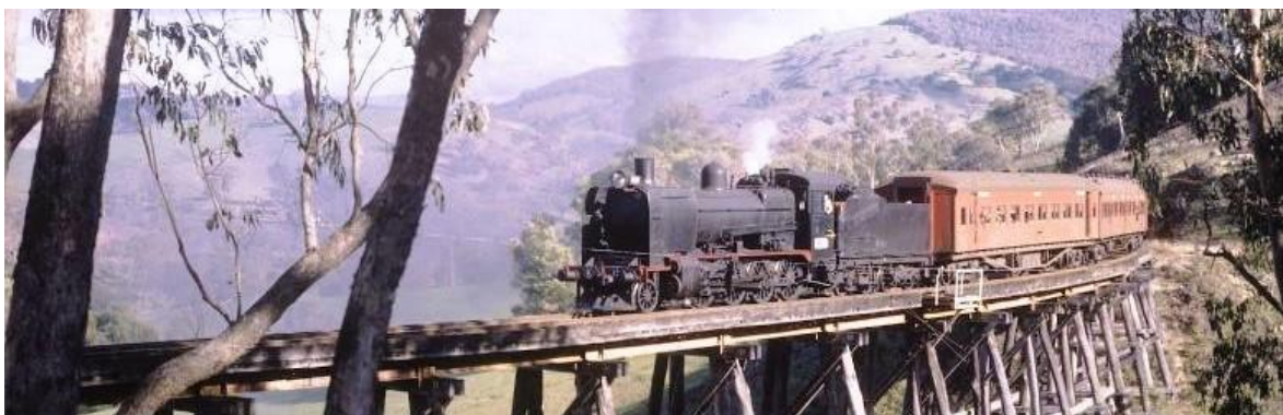
'The last steam train to Cudgewah, 27 May 1978'

' Train Buffs ' is a course for members who are passionate about trains and train engines; for those who worked on the railways or lived in 'railway families'; for those who enjoy trainspotting and travelling in historic trains. Building on members' interests, Train Buffs will offer chances to reminisce, follow up interests and deepen knowledge about trains, train engines and railways over time. The course includes classroom-based sessions with speakers on topics of interest; as well as excursions to Railway Heritage Centres and other places of interest, accompanied by lunch at a nearby café or hotel.'