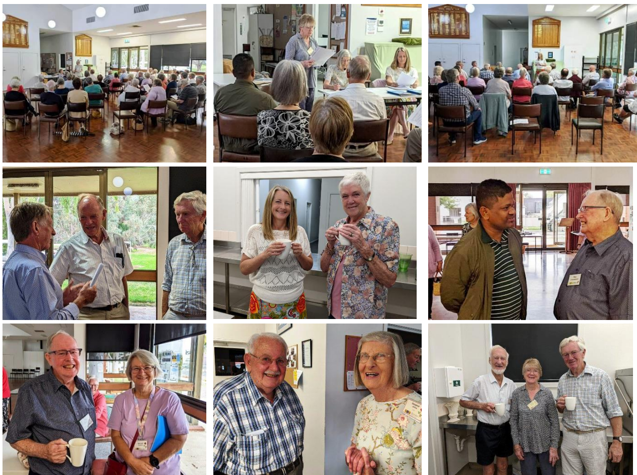
Photo Gallery – Annual General Meeting and 'Meet and Mingle' on March 16th

In the meantime, we have been sent the following information from Ambulance Victoria called Call Push Shock FAQ which we are adding to our website with their permission. The information is available to our Convenors and other U3A Members if required.