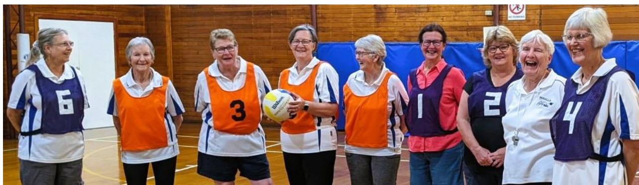
"Our Female Contingent", November 5 th