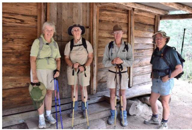
Ritchies Hut and walkers

Five walkers set off upstream from Eight Mile Flat, on the "High Track" above the Howqua River. The temperature was about 30°, but a light breeze and occasional cloud made for pleasant walking. We reached our destination, Ritchies Hut, for lunch and enjoyed the informative notice boards, a pack of playing cards and the visitors book (which is now complete to overflowing). One of the comments we read said "the track is too long, it took six beers to make it"!!! It is a delightful area in a fairly remote location. We returned on the "low track" with twelve river crossings. Each crossing took longer as we enjoyed the cooling water, and one walker yielded to the temptation of a swim at the final crossing. The total distance was about 12km and the threatened storm waited till we were home. Thanks to our leader Trevor, and driver Neville. Vaughan Cowan.