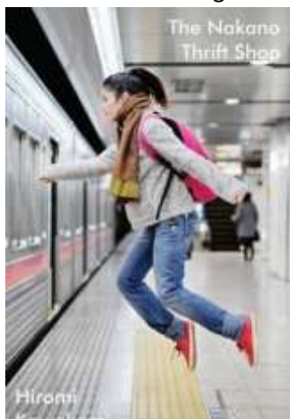
Nakano Thrift Shop