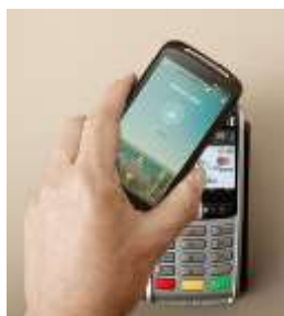
Pay by Phone