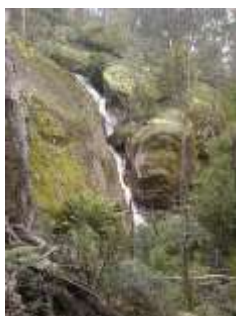
Lower Ned Falls