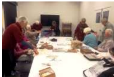
Our New Facility

At long last the move to our shared premises, the Senior Citizens and Community Centre, has taken place. I thank the